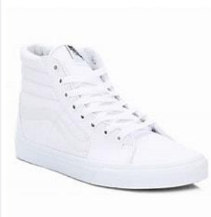
White Sneaker Hip hop (KMART, BigW or ONLINE)