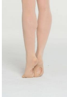
Ballet Tight Theatrical Pink